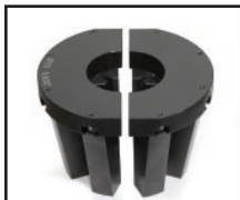
Set of Five Crimp Dies