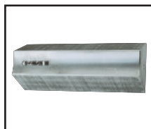
Marking Dies (pg. 41)