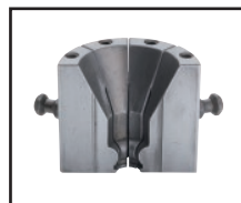
Custom Made Dies (pg. 41)