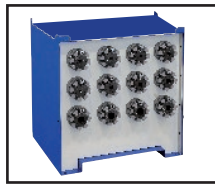
Die Holder Base (12 pc.) DIEBASE-H69