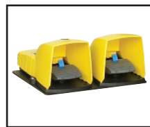
Electric Foot Pedals PEDAL-KC1