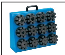
Die Rack (12 pc.) DIERACK-H69